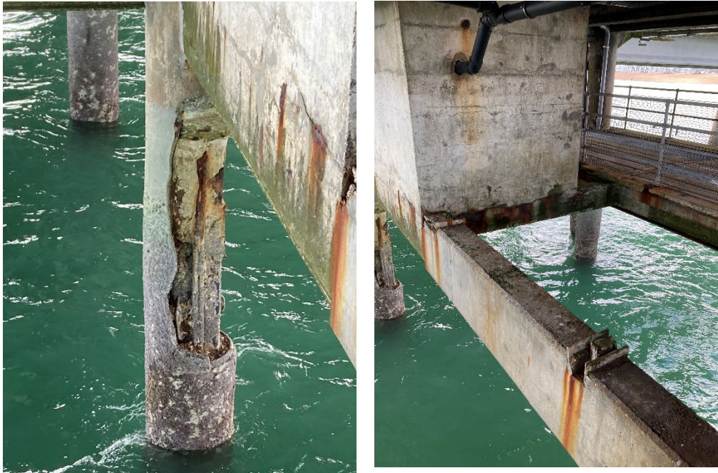
Supporting Pier legs and cross beams to pump room (lower deck).