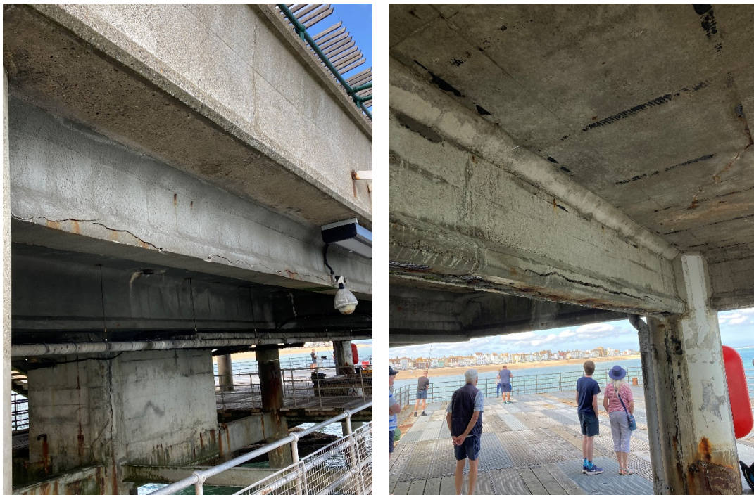
Supporting cross beams beneath Pier Café (lower deck).